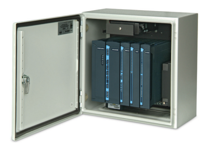
ACE3600 RTU with IGIN software can provide remote monitoring and control at multiple locations within the distribution grid.